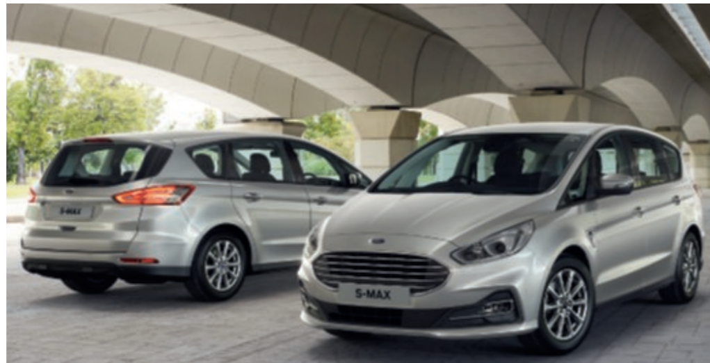
S-MAX Zetec in Moondust Silver metallic body colour (option).

*FordPass Connect features and Live Traffic are complimentary for 2 years following registration of the vehicle, thereafter a subscription is payable. Wi-Fi hotspot includes complimentary wireless data trial that begins at time of activation and expires at the end of 3 months or when 3GB of data is used, whichever comes first. Afterwards a subscription to Vodafone is required.