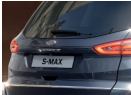
Unique Ford Vignale exterior styling (Standard)