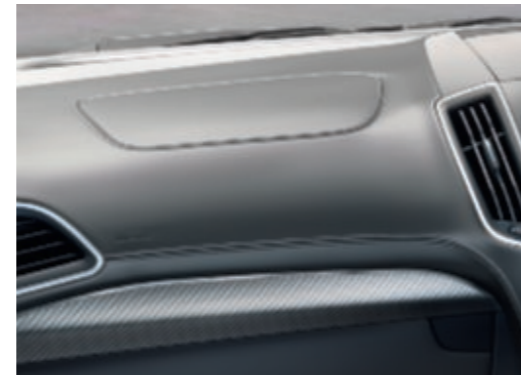
Leather-trimmed instrument panel (Standard)