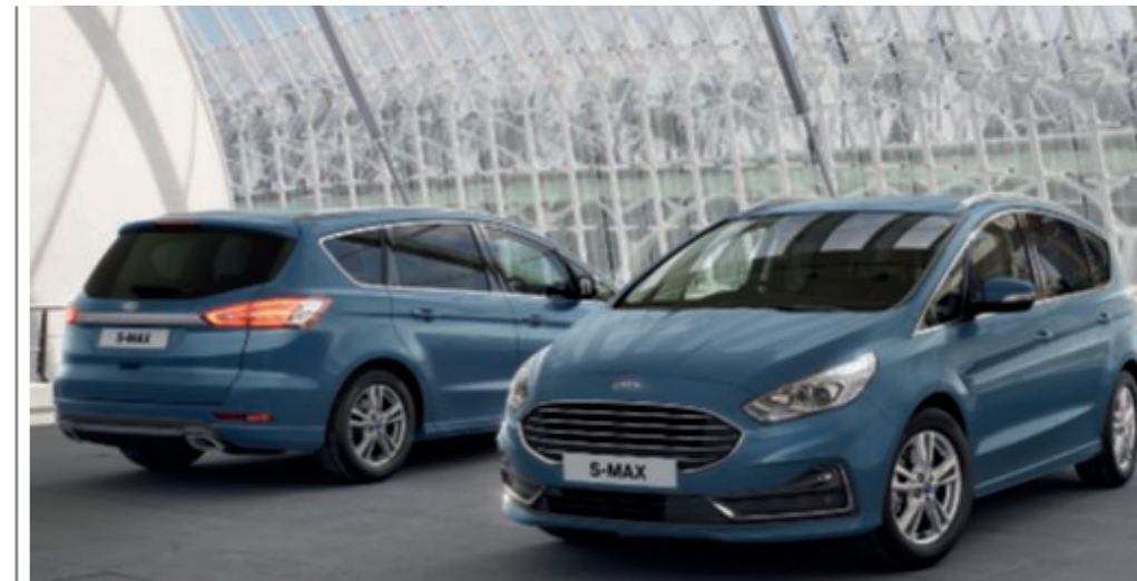
S-MAX Titanium in Chrome Blue metallic body colour (option).