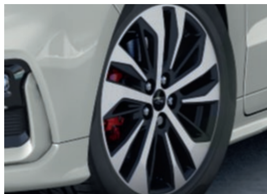
ST-Line 18" alloy wheels with red brake calipers (Standard)