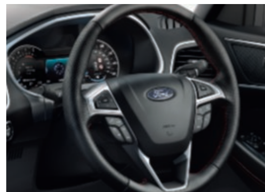
Perforated leather-trimmed steering wheel with red stitching (Standard)